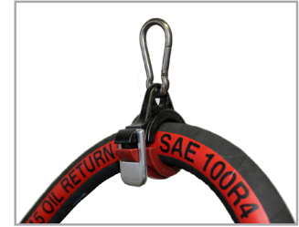
1.50" Clamp with common 100R4 hydraulic hose