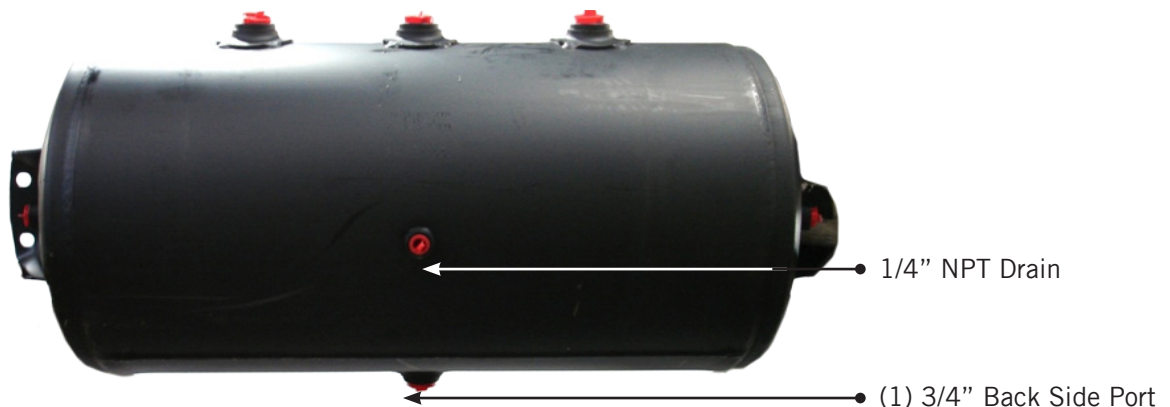
Bottom view note three 3/4" ports front & one 3/4" port back side

Air tanks meet SAE J10 and FMVSS DOT 121 for use in heavy duty air brake systems.